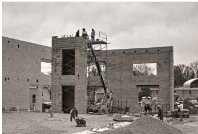
Monochrome Prints Class 1 – Tom Schum - Cowboy Foreman