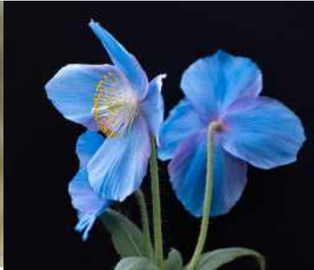
Himalayan Blue Poppies Georgette Grossman