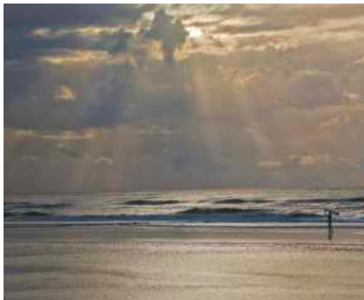
Surfing the Storm