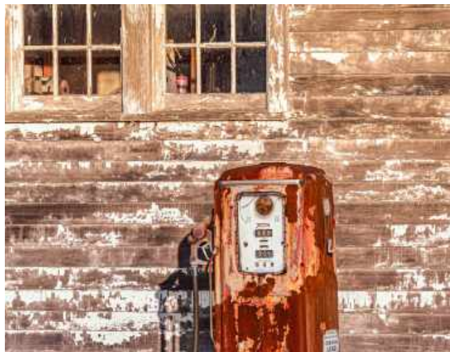
Color Prints Class 1 – Art Rose – Filler Up