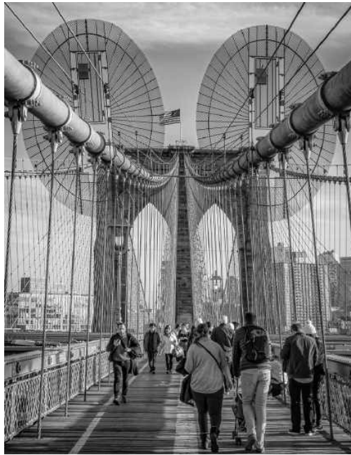
Monochrome Prints Class 2 - Kathryn Mohrmann - Brooklyn Bridge