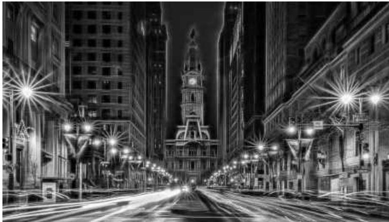
Digital Class 3 – Mike Whalen – Downtown Philly – A Different View