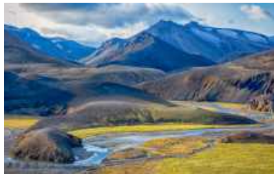
Landscape in Shades of Blue and Gold Fran Bastress