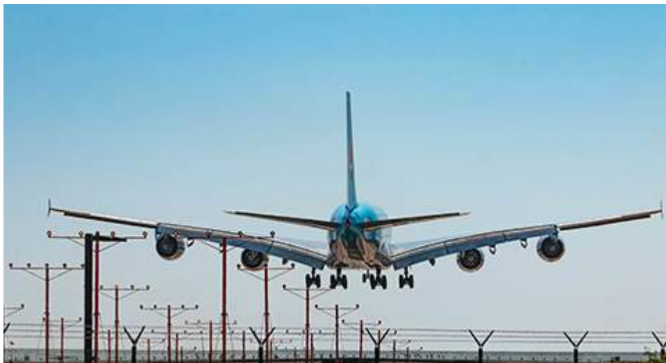
Color Prints Class 2 – Vince Alcazar – Heavy Metal