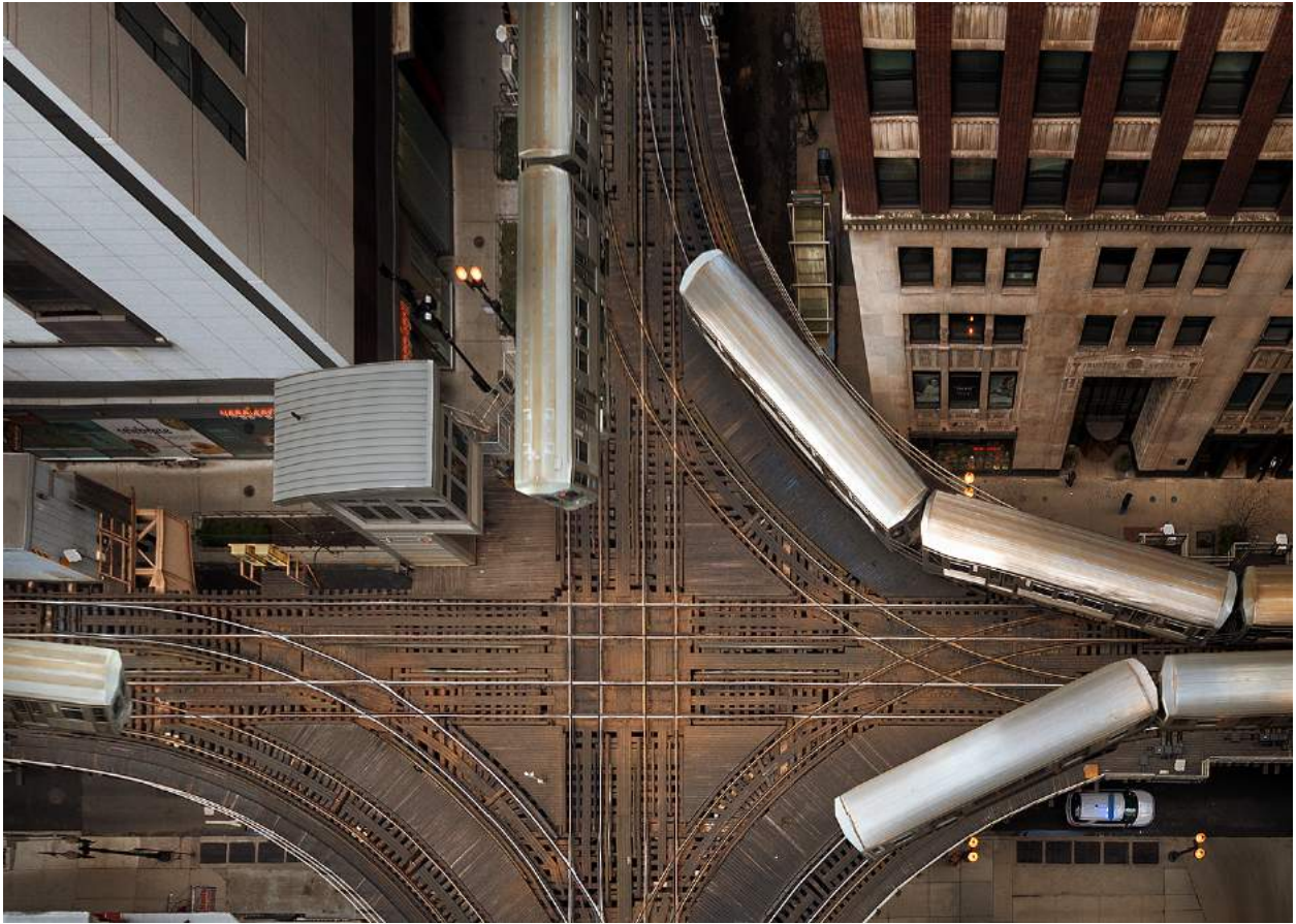
Digital Class 3- Gary Perlow – Crossroads