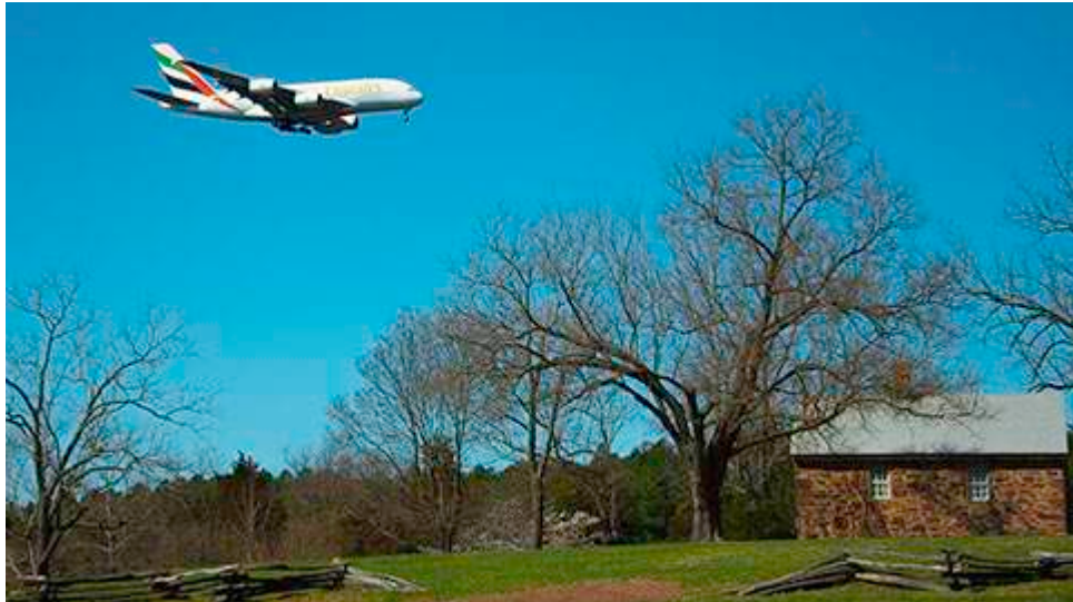
Digital Class 1 – Janice Kane - Landing Over Sully