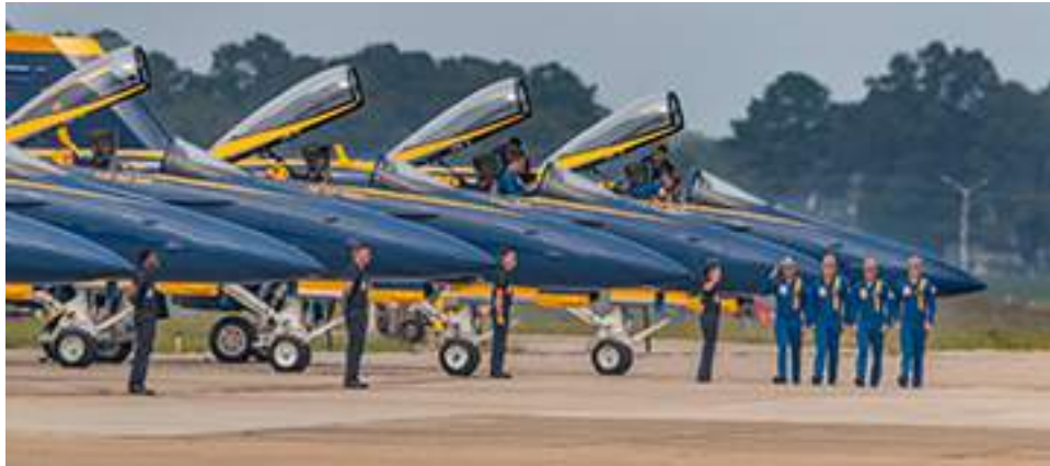
Digital Class 2 – Jeff Hancock – Blue Angles at Work