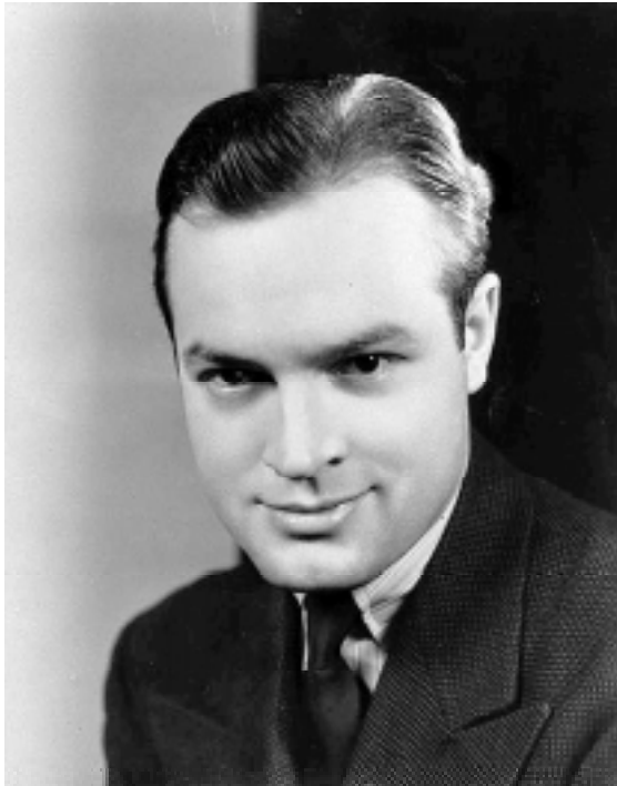
A very young Bob Hope