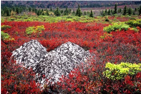
Dolly Sods, West VA