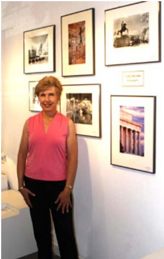
Carla Steckley's Display of Photos