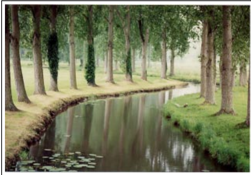
Photos by Paul Boutchia of Merrimack, New Hampshire. Shot in Normandy, France. First shot no filter and the second shot manipulated in Photoshop to make it look like a painting.