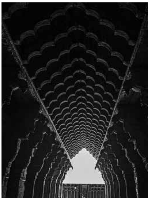
HONORABLE MENTION Siva Vittala, "Lotus Hall"