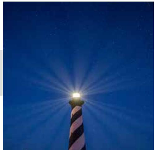
2ND PLACE Debra Mastronardi, "Blades of Light"