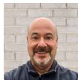
Art Rose CO-VP Competition