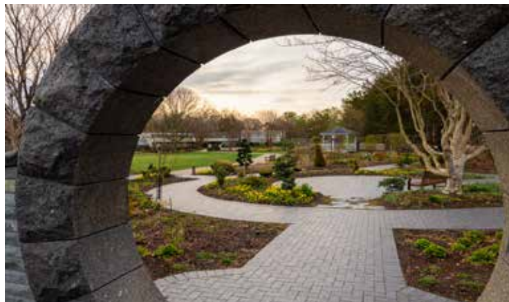
by Seton Droppers