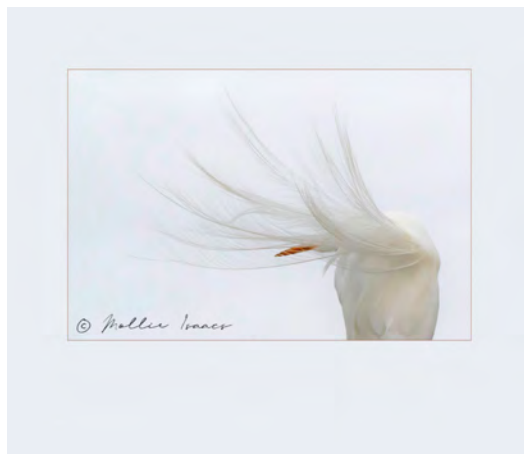
by Mollie Isaacs