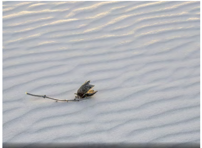
Texture in Sand