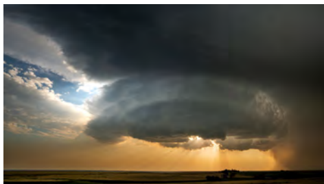
by Debra Mastronardi

lightning bolts, and the sheer scale of storm systems provide a sense of awe and respect for nature's power.