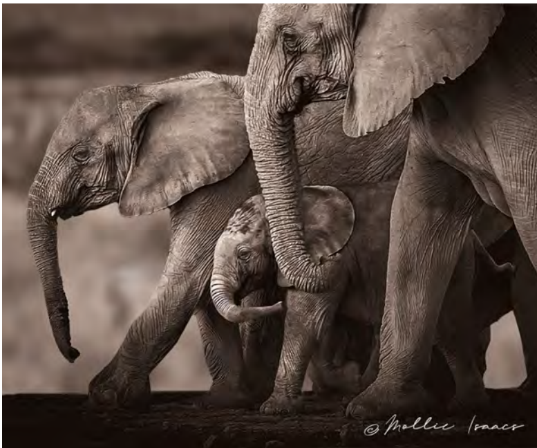
by Mollie Isaacs