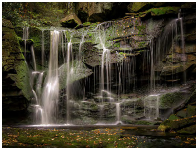
Water Motion (slow shutter causes silky appearance)

Motion (December 2024) —This theme tasks us to display motion as the dominant subject of our images. The motion could be of a person or persons, an animal or animals, a moving man-made object, water, or practically anything that is moving. Let your creativity shine through!