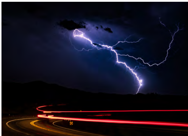
by Debra Mastronardi

Nighttime lightning is much easier and more dramatic. The technique used is very simple. Set the camera on manual everything including focus, set shutter speed to 2 to 10 seconds, attach the cable release, set drive mode to continuous shooting, and lock in the cable release to continually take shots. You will have hundreds of black screen photos and a few with lightning strikes. Use your largest capacity memory card and a fully charged battery. The most difficult aspect of nighttime lightning is acquiring manual focus in the pitch black. Usually there is a distant light or a star that can help you acquire focus. You also need to have a good command of your camera settings and buttons as it is difficult to adjust settings in the dark.