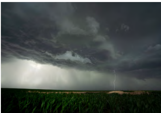
by Debra Mastronardi

The Tornado Alley workshop started in Denver and then we hit the road for eight days! You spend the majority of your day in a van traveling to the next potential big storm. There is no home base, every night you are in a different town, and you are unpacking and packing up every day. There is little to no time for photo processing, and you are on the gas station and fast-food diet. On our first day, we spent 15 hours driving and covered 710 miles! Most days begin around 8:00 a.m. and end after 11:00 p.m. We covered 3,000 miles and five different states— Colorado, Nebraska, Kansas, Oklahoma, and Wyoming. This type of travel can be very taxing and when you are in the chase, there is no stopping for bio breaks or food. It's typically "go time" from 3:00 p.m. to 11:00 p.m. and most nights there wasn't any time for dinner.