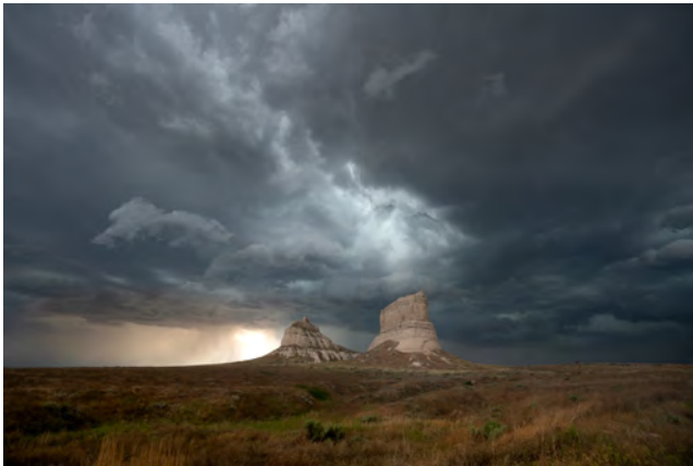
by Debra Mastronardi

To capture lightning during the day, you attach the lightning trigger to the hot shoe and plug it into the camera. Before turning it on, you compose the scene, acquire focus, set the shutter speed to 1/4 second or longer, and set your aperture setting to achieve the slower shutter speed. If you can't get to 1/4 second on your shutter speed, you can use an ND filter or polarizer to achieve these settings. Then you wait for the lightning show to begin as the trigger senses optical flash pulses and triggers your shutter. Daytime lightning is the most difficult to capture and the lightning trigger has about a 50% capture rate. When the trigger is active, you can't review your images since basically the trigger takes over the camera. To check your images, you need to shut off the trigger and inevitably this is when the best lightning strike happens!