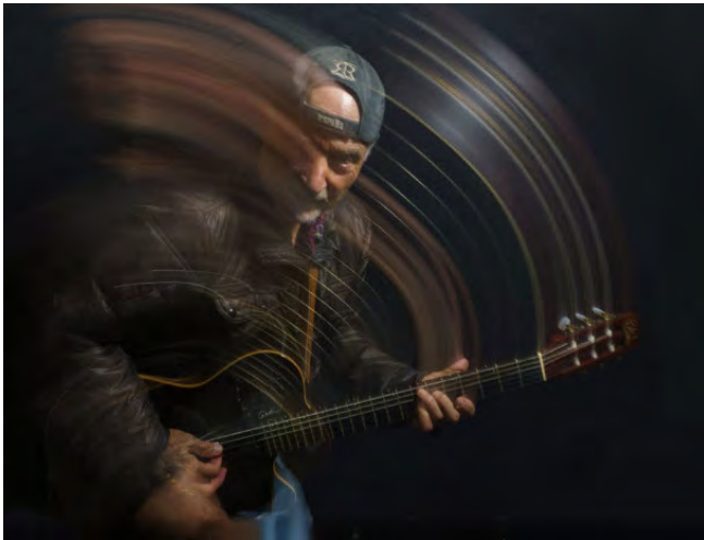
Self–Portrait (using 2 second shutter timer)

Texture (April 2025) —Texture is described as the visual or tactile/touchable appearance of something. This theme challenges you to capture a photo with a clearly dominant subject that features texture that can be felt through the presentation of the image.