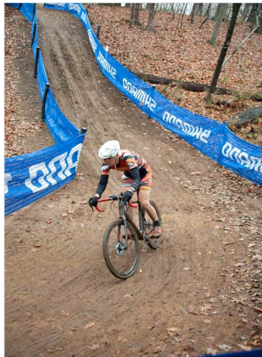
by Rena Schild