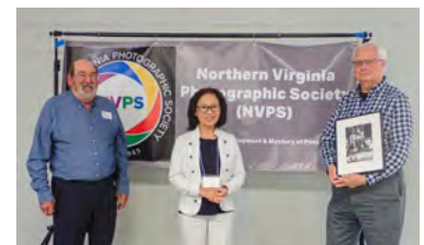
Member’s Galleries and Forum