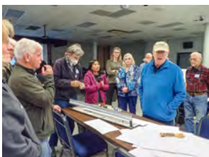
Education and Training

p.s. Enjoy some images from our in-person meetings.