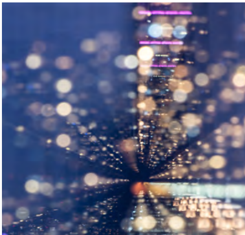
by Angie McMonigal

Join Angie for a discussion focusing on creative approaches to architectural subjects. The emphasis will be on architectural details and creating abstracts of the built environment. She'll share how to uncover creative viewpoints and how to best utilize compositional tools to create more compelling images.