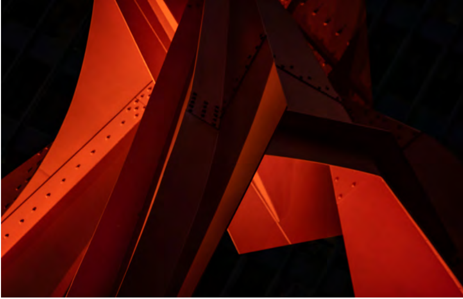
by Angie McMonigal

Angie's focus is more frequently on bold architectural details rather than sweeping cityscapes.