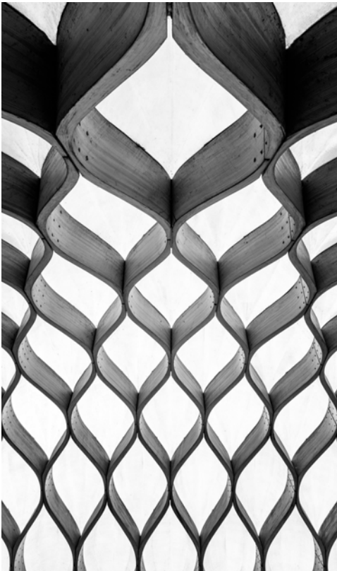
by Angie McMonigal

Angie's focus is more frequently on bold architectural details rather than sweeping cityscapes.