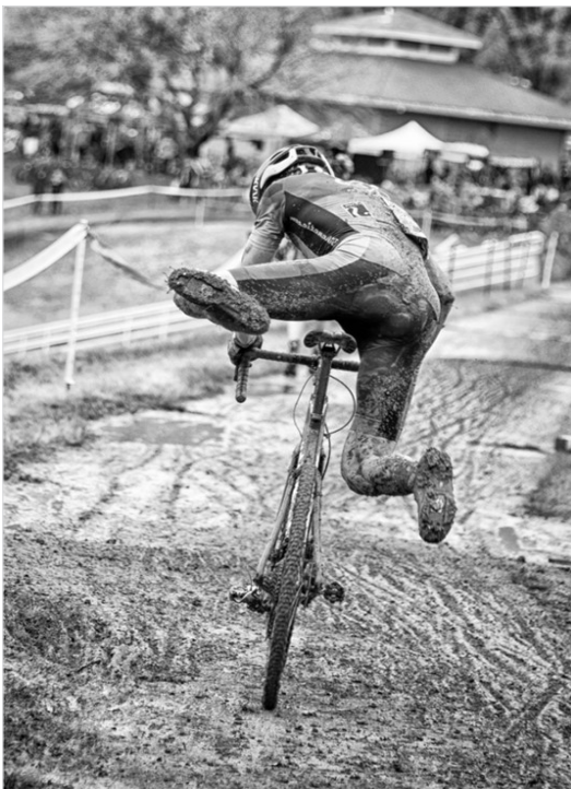
by Rena Schild

Images from the Field Trip in club year 2023–2024 may be viewed at: NVPS Field Trips Gallery .