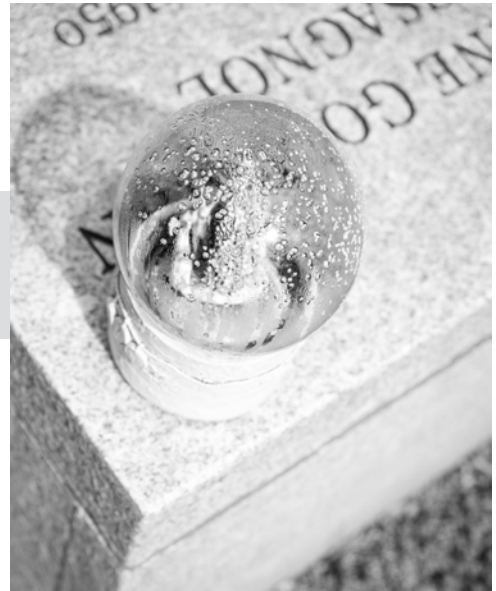
2ND PLACE Phyllis Kimmel, "Remembrance"