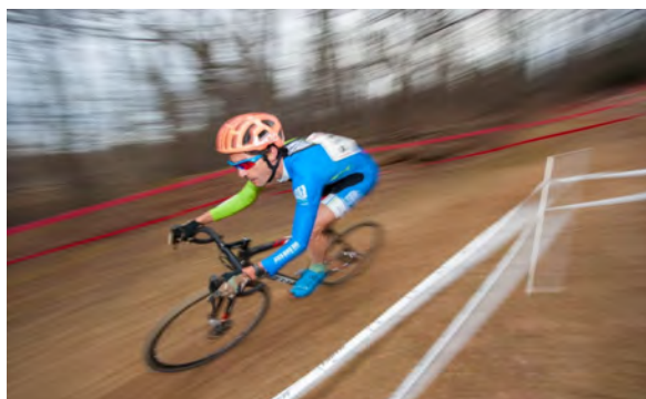
by Rena Schild