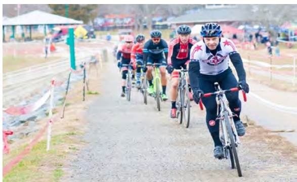
by Rena Schild