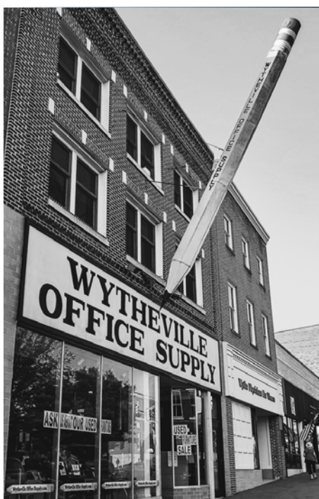
3RD PLACE Jack Ledgerwood, "Number 2 Pencil"