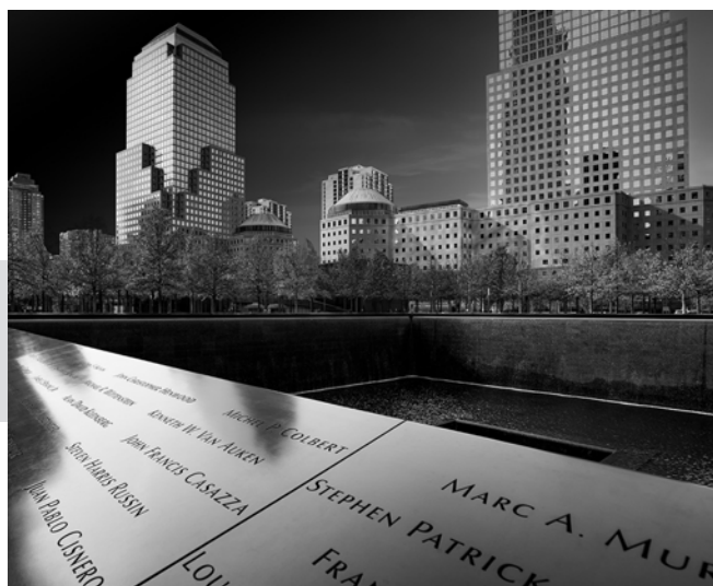
2ND PLACE Robin Weisz, "Ground Zero"