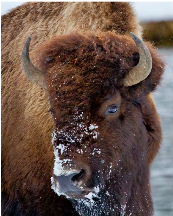
Tom Hady—"Winter Face"

I went on to have prints accepted for showing in exhibitions from Washington, DC, to Washington state, and from England to India, more than 2000 times. Much of what I needed to learn to make that happen I learned at NVPS!