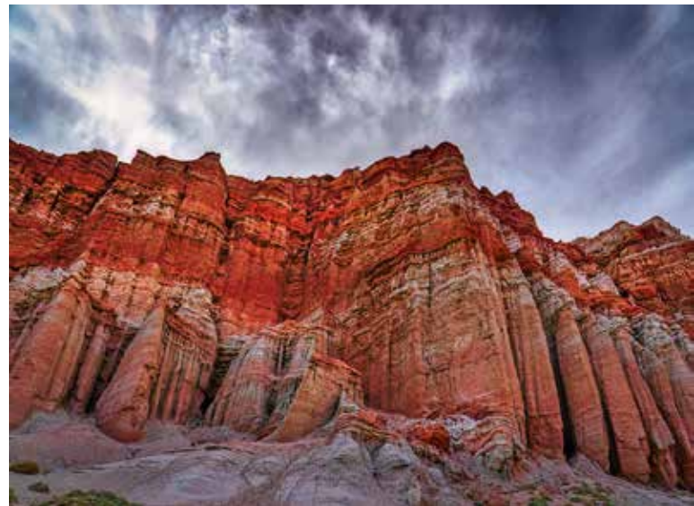
Thu Huynh—"Red Rock Canyon State Park, CA"