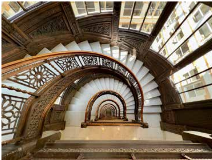
by Nick Sinnott

With the iPhone being the most used camera in the United States, it's important to learn how to take full control of your photography. Join Nick Sinnott for an exploration of all the features and functions your iPhone camera has to offer. We'll start with the basics and work our way up to more advanced functions (many that you didn't even know your iPhone could do). You'll learn about exposure, focus, and focal length control, how to take great long exposures and night photos, and get tips and tricks for composing eye-catching images. Plus, Nick will show you how to edit and organize your photos using the photos app, and share some