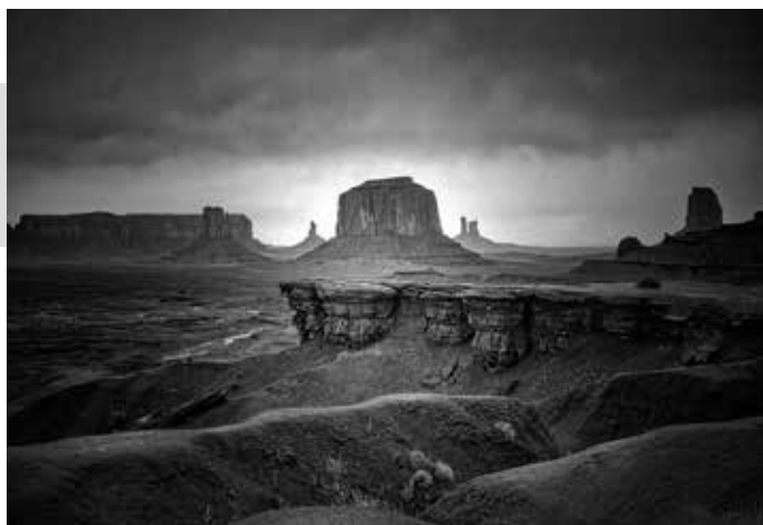
2ND PLACE Thu Huyn, "Monument Valley Utah"