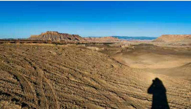
Thu Huyhn—"Factory Butte, UT"