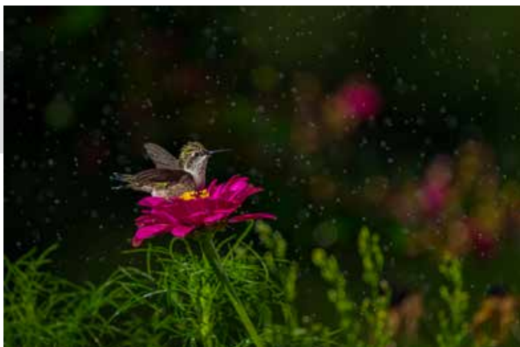
2ND PLACE Stanley Bysse, "Liquid Sunshine"