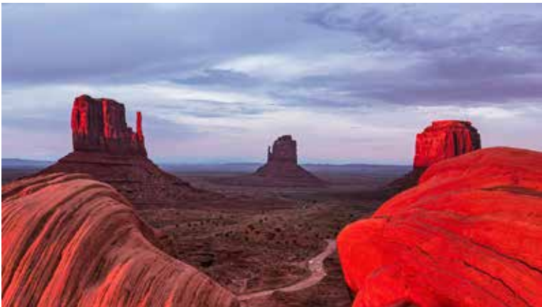
Thu Huyhn—"Monument Valley, UT"

Thu will share images from her very busy road trip in the southwestern US.