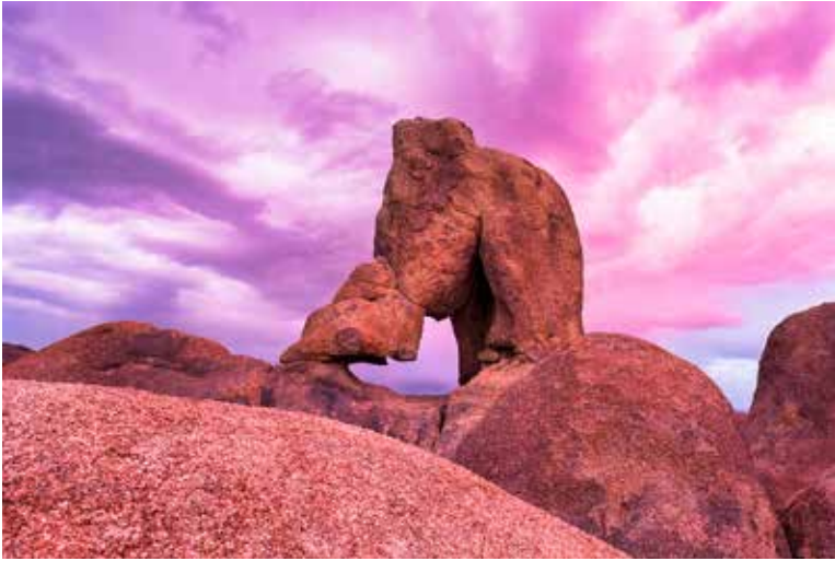
"Boot Arch at Alabama Hills, CA"