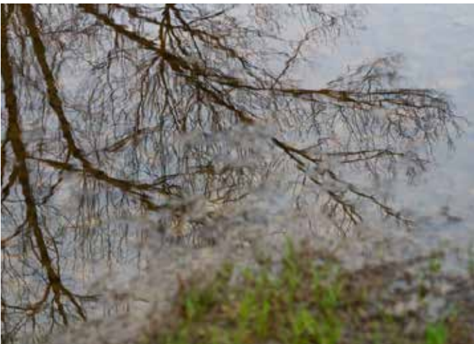
Dee Ellison—“Reflections in Bluemont Park 1/366”

I hope you will consider picking up your camera on a daily basis, whether it is from the first of the year, month, or whatever fits into your schedule. Just know that the more you use your camera, your photos will improve.