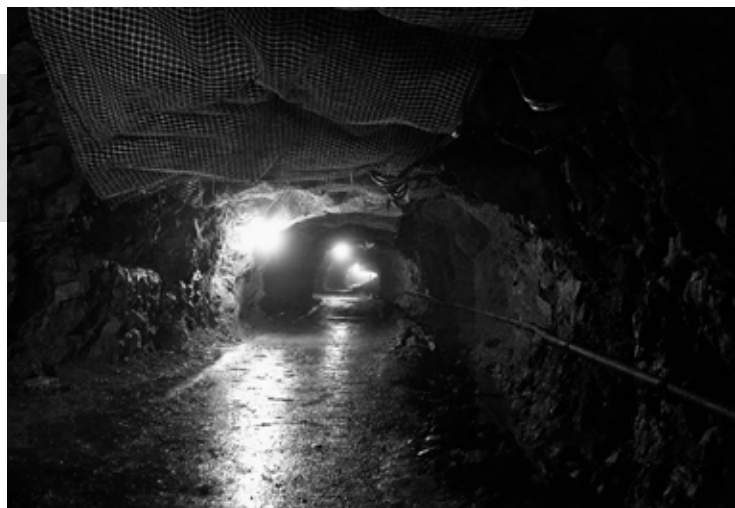
2ND PLACE Alan Goldstein, "Going Deep"