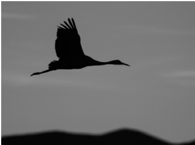
Jim McDermott—"Coming in at Dusk"

Jim will discuss important things to consider when you are printing your photography.