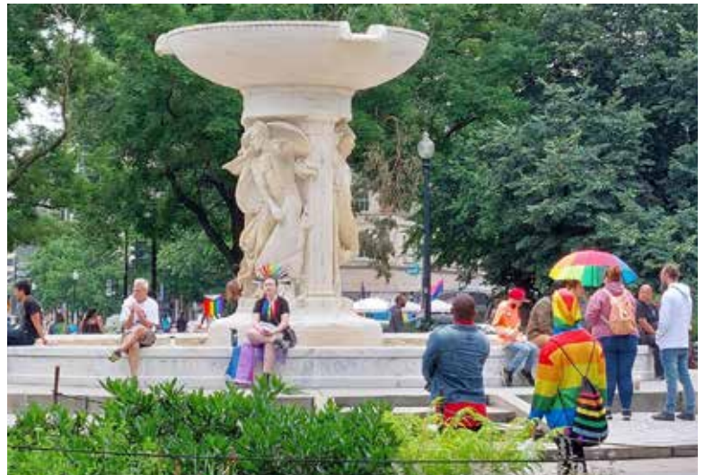
by the National Park Service