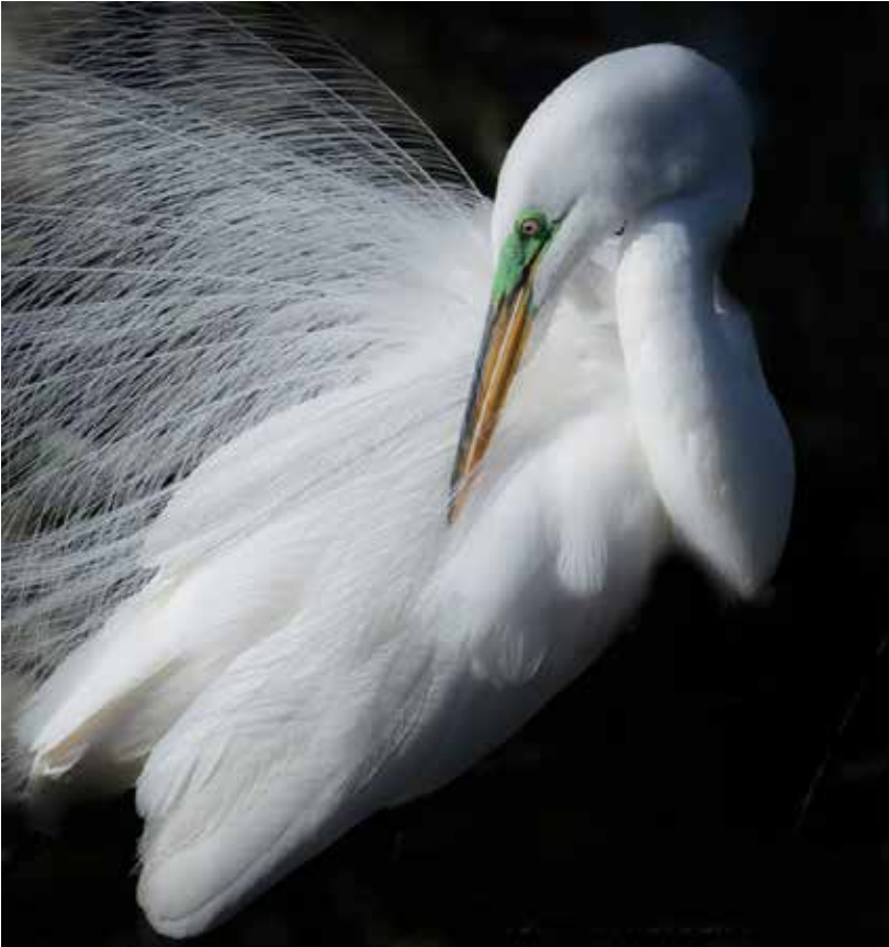
by Rena Schild

Rena's interest in wildlife photography started during the pandemic.