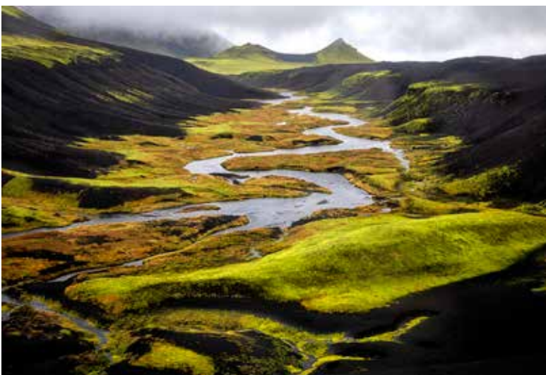
by Judy Graham from Arctic Exposure's Iceland Highlands Tour