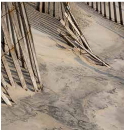
Natural Sand Example

designs. Sand is also a basic landscape material that might escape notice. From the sand dunes on a wind-swept beach to desert sands, sandcastles, meditation gardens, local parks, children's playgrounds, and sports fields, the possibilities are all around us.