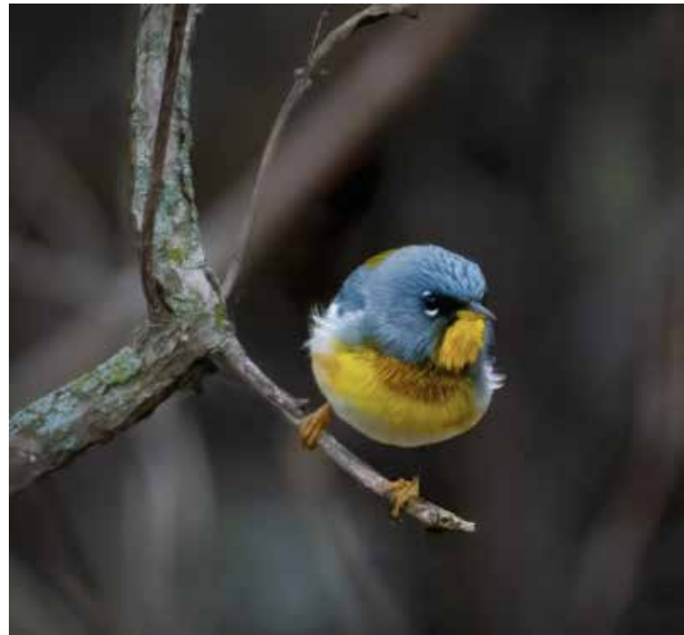
by Rena Schild