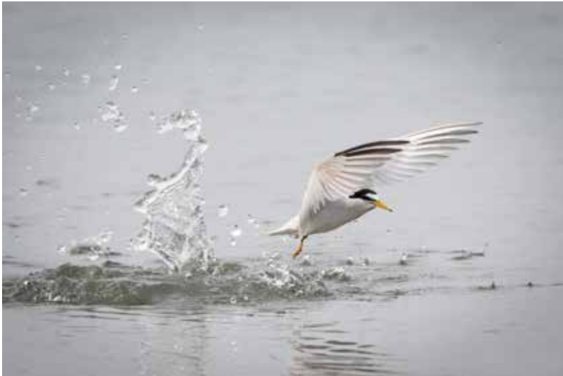
by Rena Schild

Rena's interest in wildlife photography started during the pandemic.