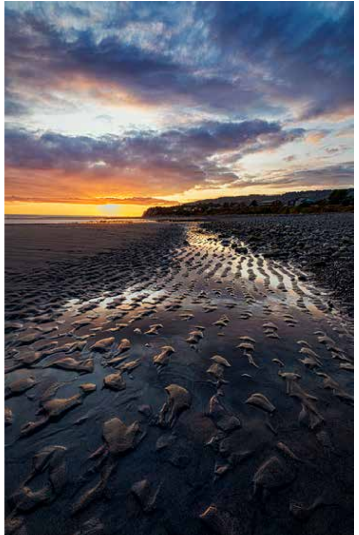
by Judy Graham from David Shaw's Alaska Workshop

In summary, photography workshops are more educational and skill-focused, while photography tours are centered around travel and capturing images in various locations with a focus on the overall experience. Depending on your goals and interests, both workshops and tours can be valuable opportunities to enhance your photography skills and creativity, as well as travel to some extraordinary places!