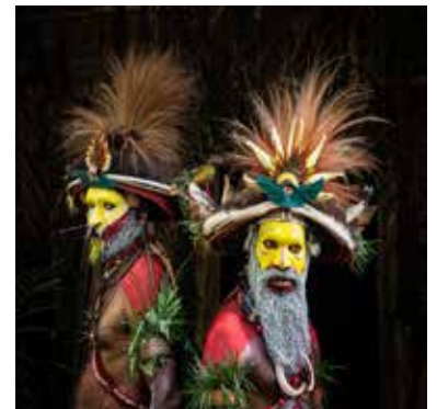
Kathryn Mohrman—"Two Yellow Faces" Honorable Mention