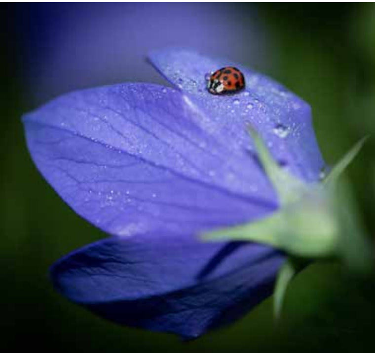
by Rena Schild