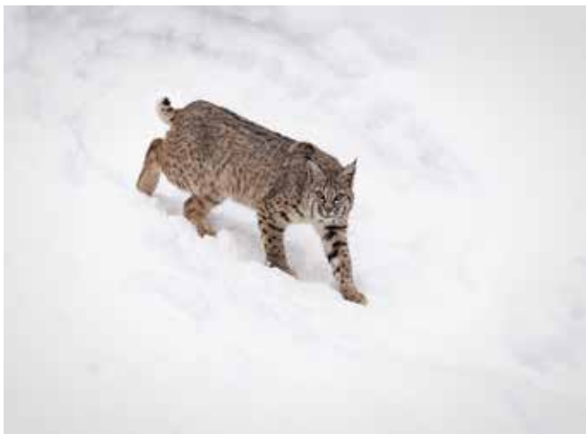
by Judy Graham from Nikhil Bahl's Yellowstone Workshop

photography tour is to take participants to picturesque or culturally significant places, providing them with opportunities to capture unique and beautiful images. These tours are often led by experienced photographers who can offer tips and advice on capturing the best shots, but the focus is more on the destination and the overall experience. Tours are well suited for all levels of photographers.