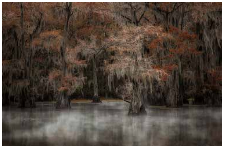
from Backcountry Journeys' Caddo Lake Workshop

With Backcountry Journeys all I do is show up where they tell me to on the first day. From there I can focus on my photography, seeing amazing scenery, and having fun. I have now been with them on four workshops and have worked with several of their pros. I have five more workshops planned with them in the future.