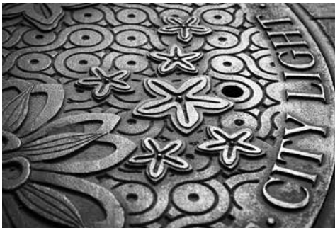
Written Language Example

Sand can't help but play with wind and water to make beautiful and interesting