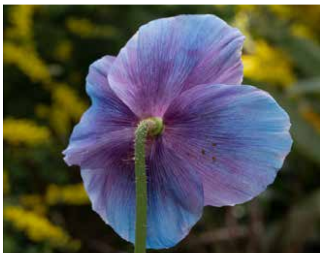
Jim McDermott—"Himalayan Blue Poppy"