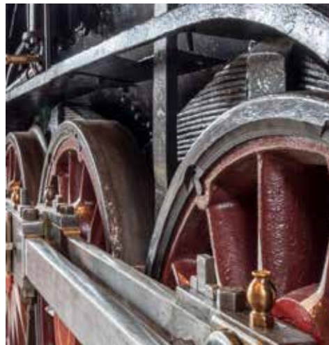
Making the World Go 'Round—Gears, Sprockets and Wheels Example

Making the World Go 'Round—Gears, Sprockets and Wheels (Mar 2024) —The image should include gears, sprockets, or wheels. Gears, sprockets, and wheels have two things in common—they are round and move in a circular motion. Some we see daily, such as bike and auto wheels, while others are usually hidden from view, such as gears in many watches and clocks. They come in all sizes, from minuscule to gigantic. Some are practical and utilitarian, and some are colorful and fun. They could be in motion or at rest. They could be functional or no longer in service.