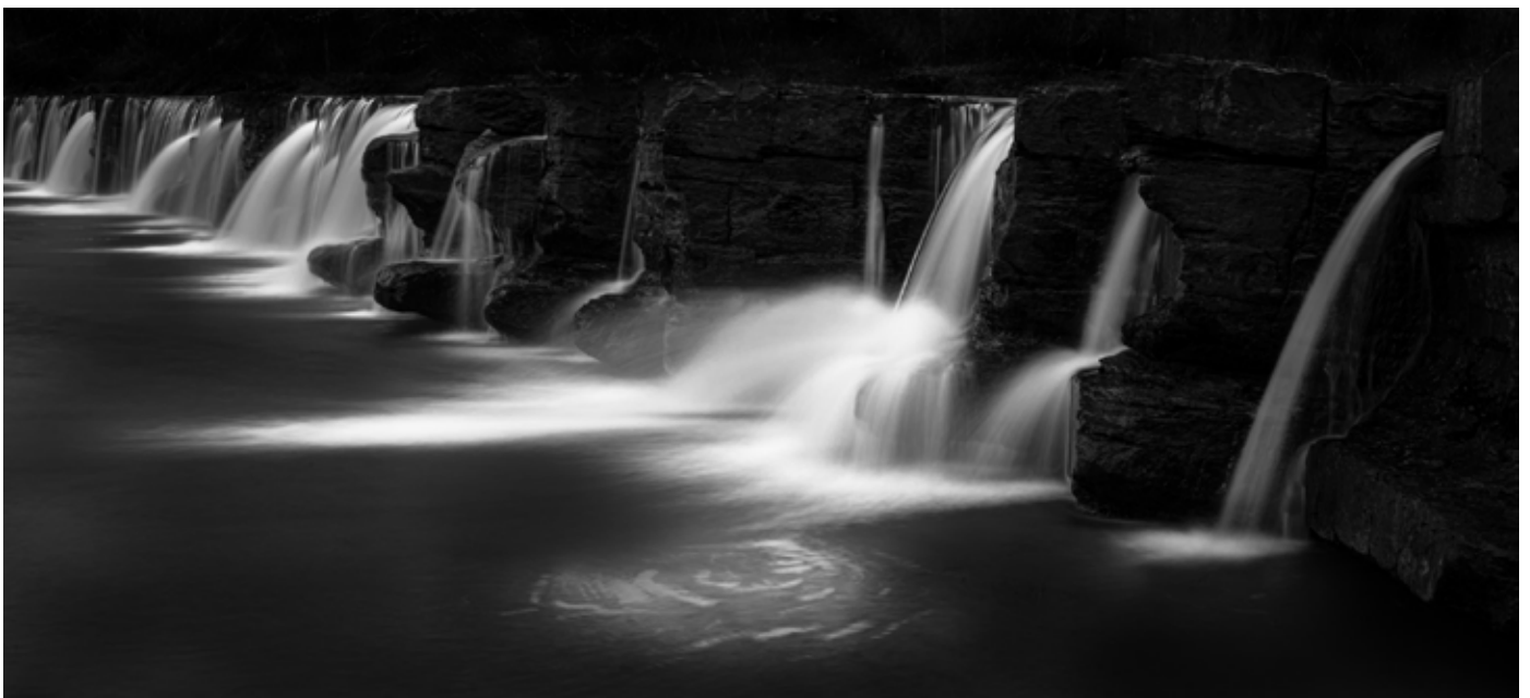
Best in Water MAPV 2022—Lynn Cates—"On And On"