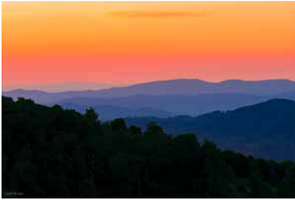
David Kravitz—"Sugar Mountain Sunset 1"

David Kravitz received Third Place for his image "Sugar Mountain Sunset 1" in the 15th Marumi "Landscape photography taken with/without Filters (Vol.2)" photo contest.