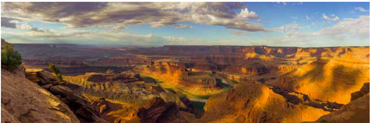
Brian Zwit—"Dead Horse Canyon"