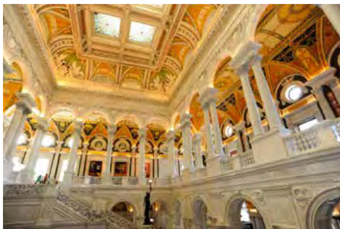
by Rena Schild