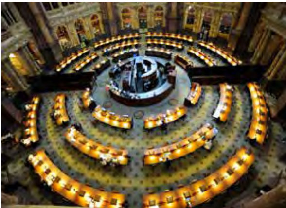
by Rena Schild