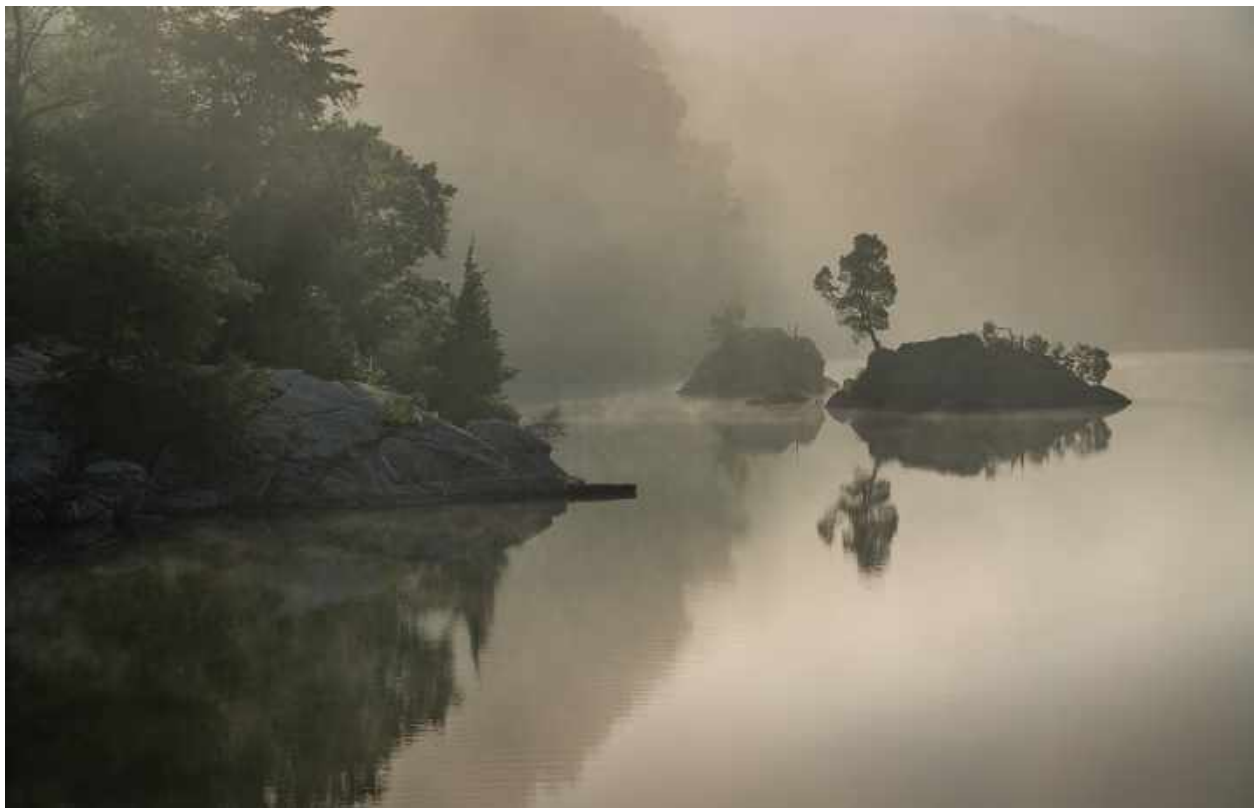
Color Prints Class 2 – Tana Ebbole – Misty Morning AT Anglers