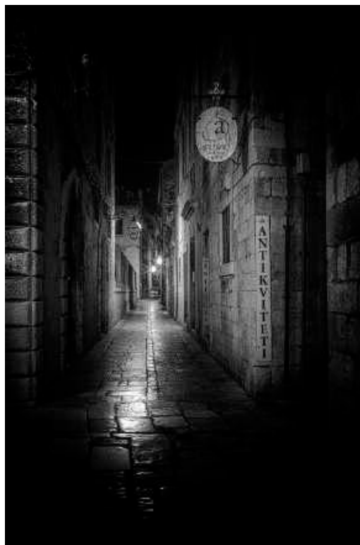
Monochrome Prints Class 3 – Kieulan Ngugen – Emptiness