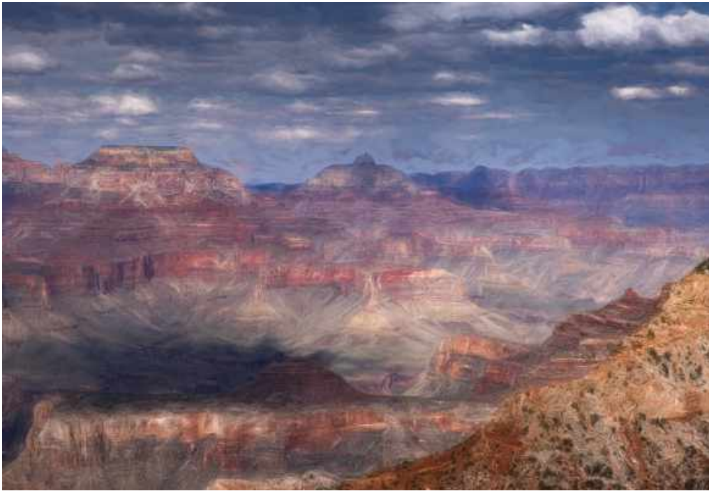
Digital Class 2 – Joan Barker – Grand Canyon