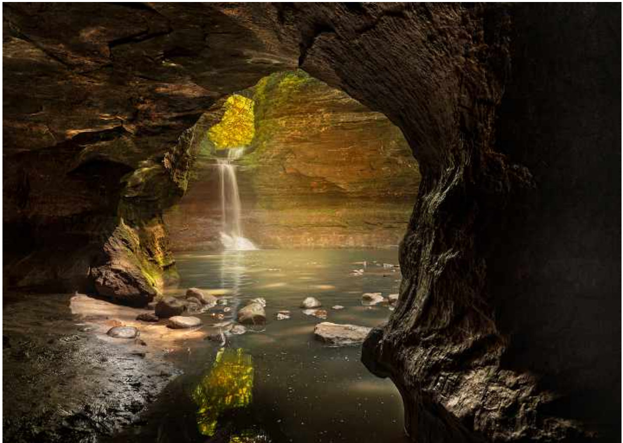
Color Prints Class 3 – Gary Perlow – Cascade Falls