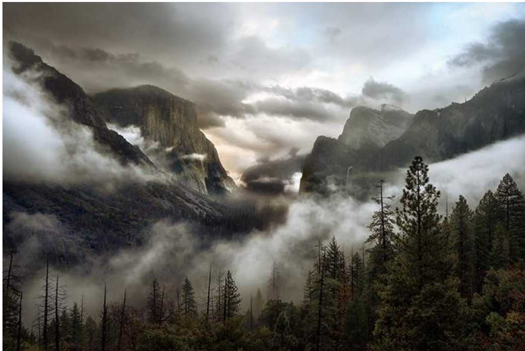
Digital Class 3 – Gary Perlow – Upper Valley Morning