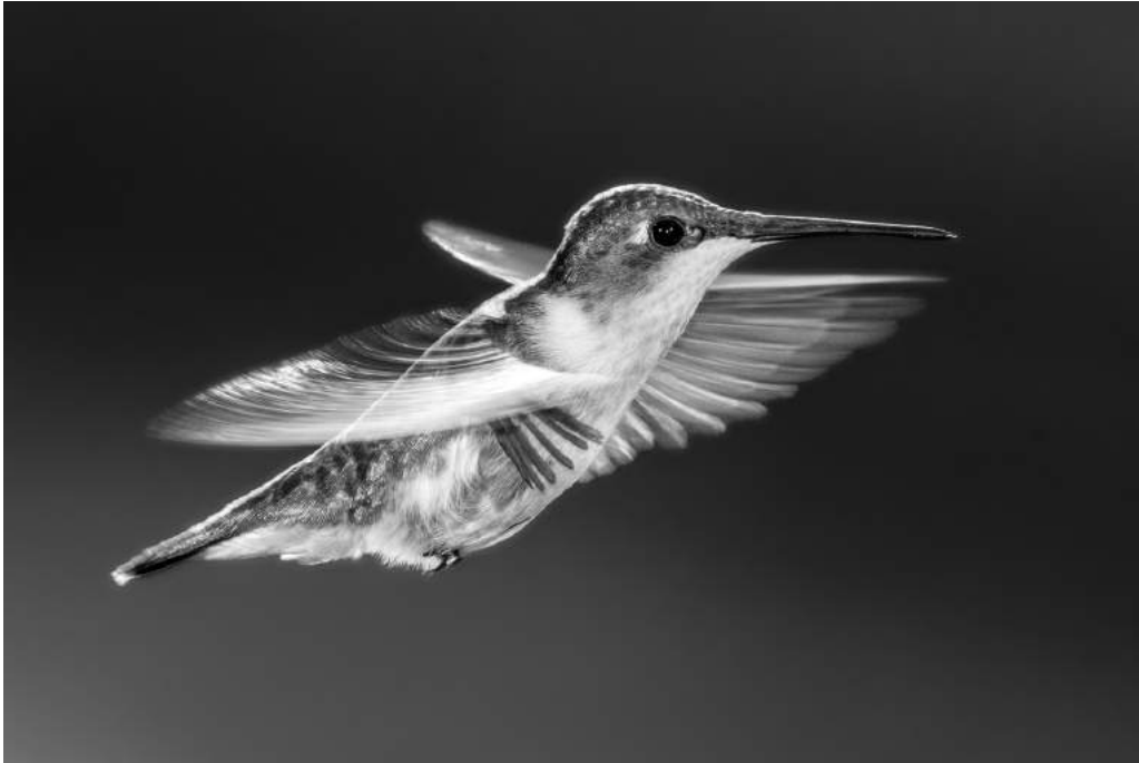
Monochrome Class 3 – Bill Corbett - Summer Hummer 2017