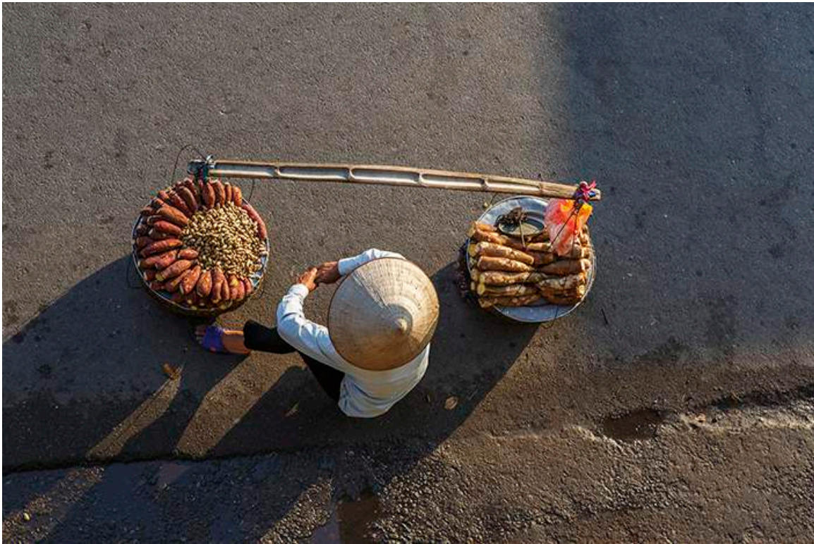
Color Prints Class 2 - Kieu-lan Nguyen – Street Vendor