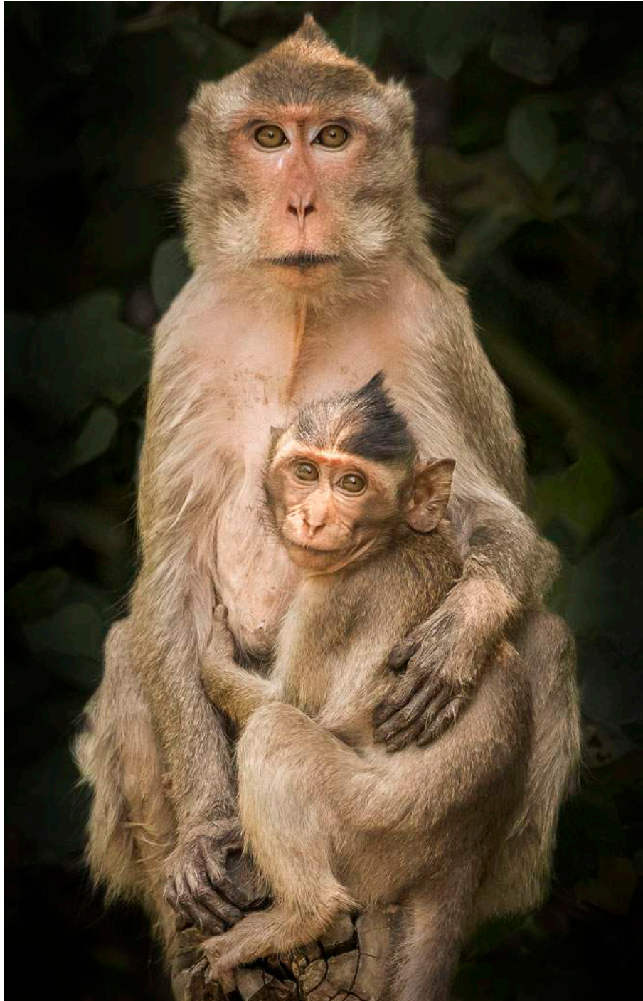
Digital Class 1 - Arthur Rose - Embrace