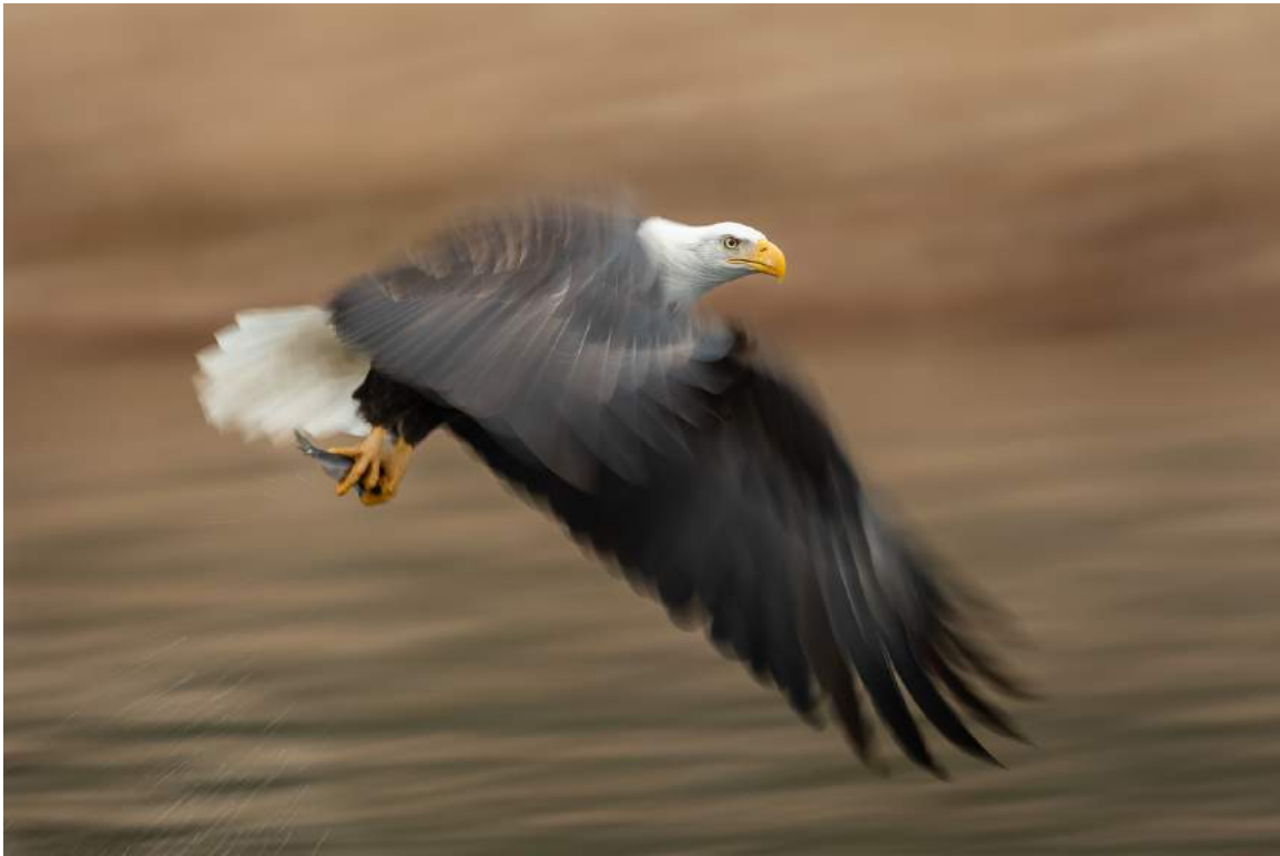
Color Prints Class 3 – Stan Bysse – The Catch