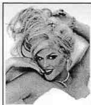
Anna Nicole Smith

Our judge for the next upcoming Competition will be the celebrity Anna Nicole Smith. She will be in the Washington, D.C. area during the month and we've asked her to do the judging for our Competition. She has absolutely no photographic training, but then, who cares. Please give her a warm welcome when she's here. She requested to meet some of our members after the Competition. Those she wants to meet are the men in our club who are older than 85 and not in good health.