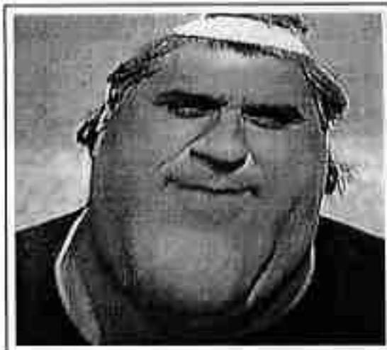
Iron Jay Lens